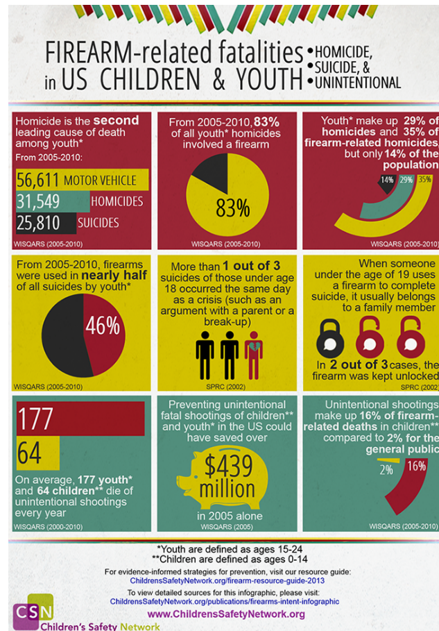
Figure 2: This is an example of a list infographic (“Firearm-Related Fatalities in US Children & Youth: Homicide, Suicide, and Unintentional.”).

In this example, one can understand the purpose or what the creator wants to educate their audience on based on the title (see Figure 2). In this case, the creator wants to educate their audience about firearm killings that involve youth and children. In this case, it is evident that the information and purpose of this list infographic contain more serious matters and is a heavy topic. Therefore, this infographic would be meant for adults. To continue, the use of the graphics also prove that this genre would be meant for adults since children may not know how to interpret the information. Based on the purpose of the list infographic, it allows one to interpret the audience.